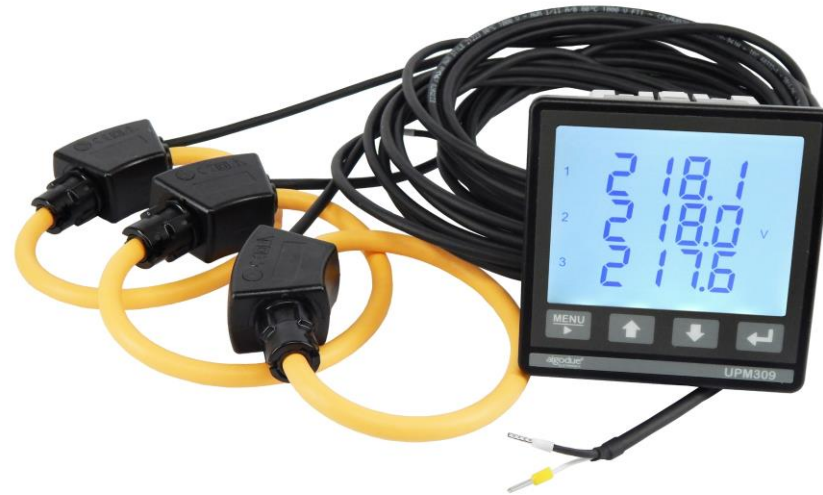
UPM309RGW For Panel mounting