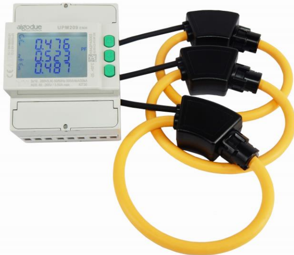
UPM209RGW For Din Rail mounting